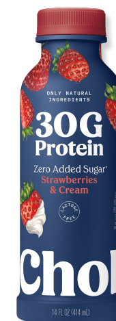
Chobani Protein Shake