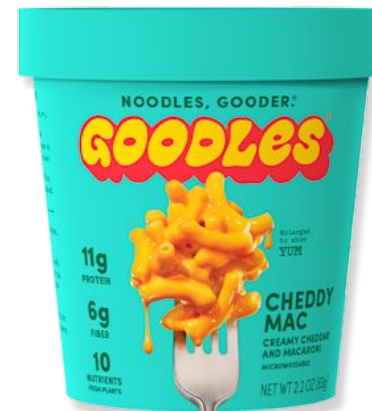
Goodles Mac N Cheese