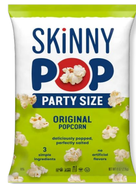
Skinny Pop Popcorn