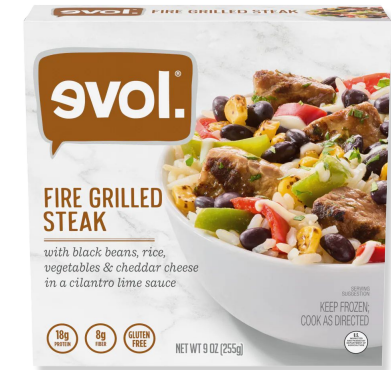
EVOL Fire Grilled Steak Bowl