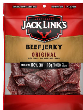
Jack Link's Beef Jerky