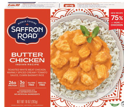
Saffron Road Butter Chicken