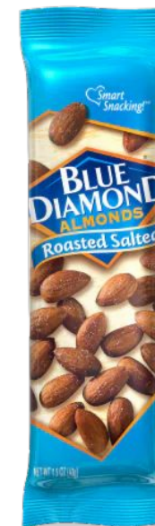
Blue Diamond Almonds