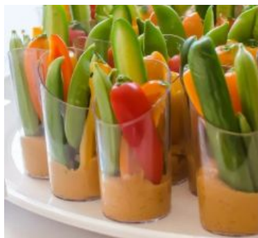
Hummus with Veggies