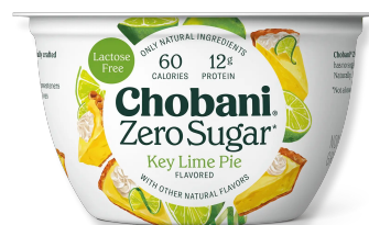
Chobani Greek Yogurt