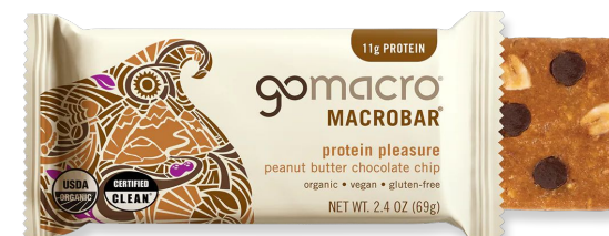
GoMacro Protein Bar