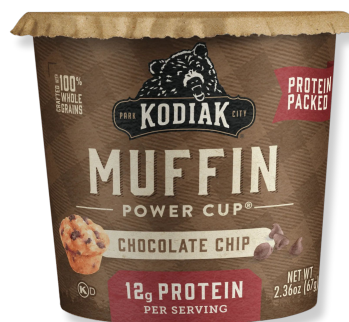
Kodiak Protein Muffin