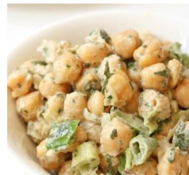
White Bean & Kale Salad