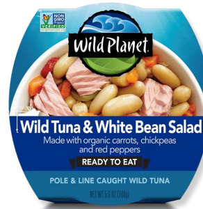
Wild Planet Tuna Salads