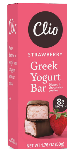
Clio Greek Yogurt Bar