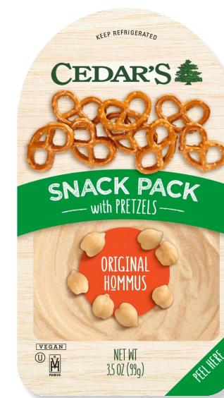
Hummus Snack Pack