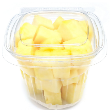
Pre-Cut Fruit Cups