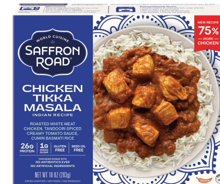
Saffron Road Chicken Tikka Masala