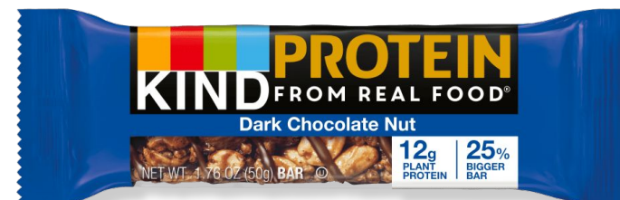
Kind Protein Bar