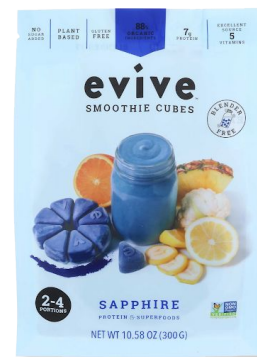
Eville Smoothie Cubes