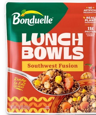
Southwest Fusion Lunch Bowl