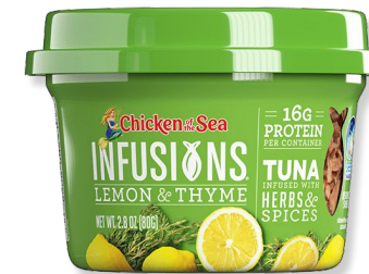
Lemon & Thyme Tuna