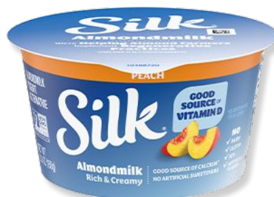
Silk Dairy-Free Yogurt