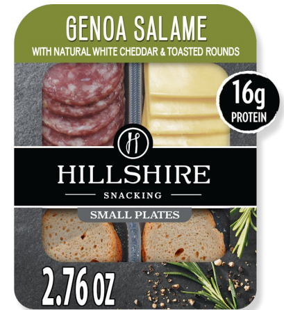
Hillshire Charcuterie Pack