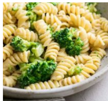
Lemon Broccoli Chicken Bowl