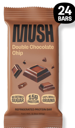
Mush Protein Bar