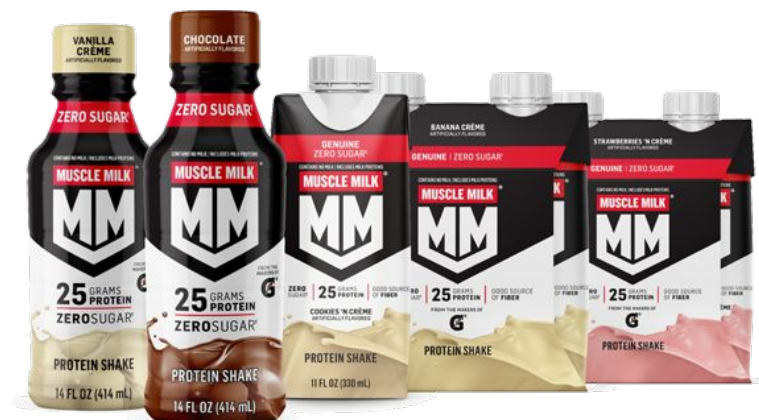
Muscle Milk Protein Shake