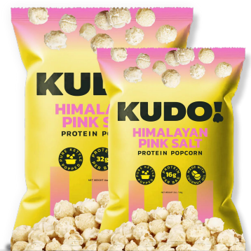
Kudo Protein Popcorn