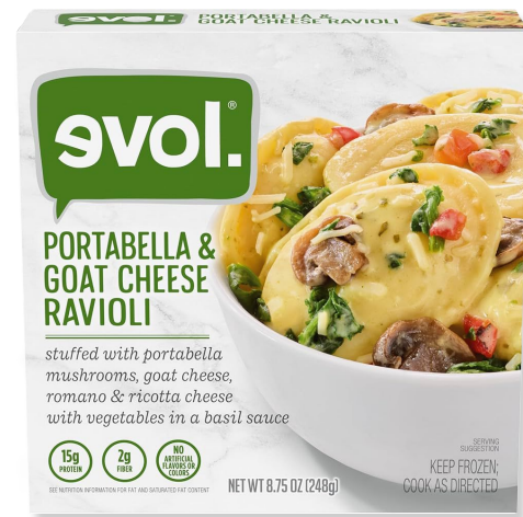
EVOL Mushroom & Cheese Ravioli