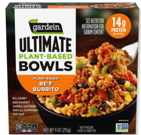
Gardein Be'f Bowl