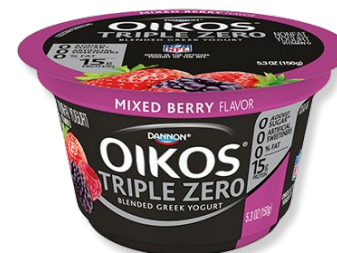
Oikos Greek Yogurt