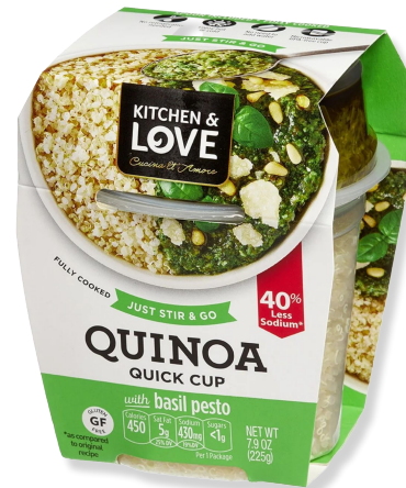
Quinoa & Pesto Cups