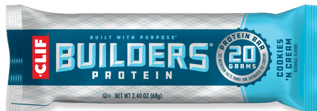
Clif Builder Protein Bar