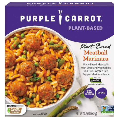
Purple Carrot Meatball Marinara