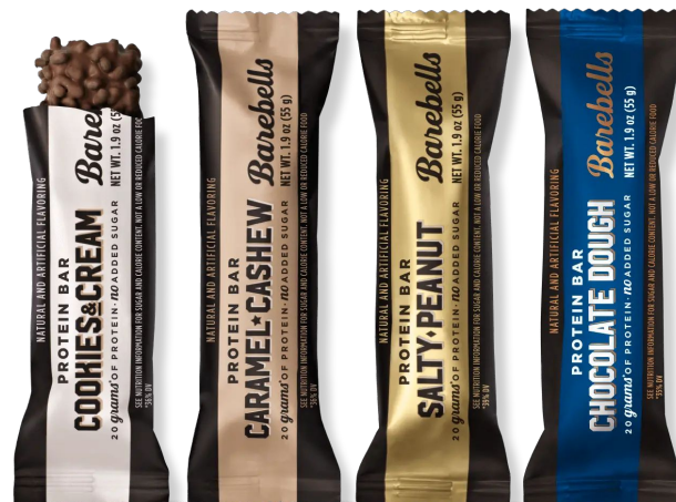
Barebells Protein Bar