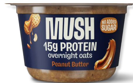
Mush Overnight Oats