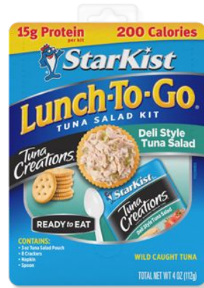
Tuna & Crackers Kit