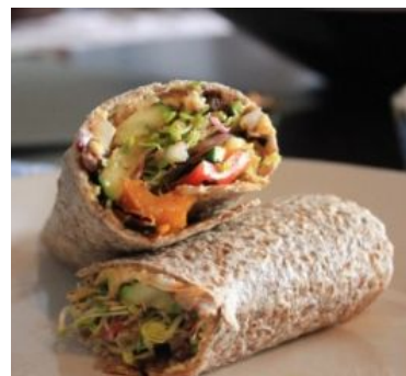
Grilled Vegetable & Hummus Wrap