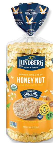
Honey Nut Rice Cakes