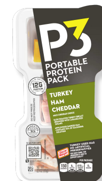
P3 Protein Pack