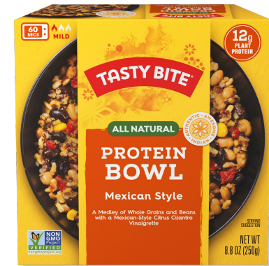
Tasty Bite Protein Bowl