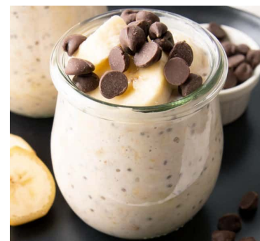
Chocolate & Banana Overnight Oats