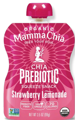
Chia Seed Pouches