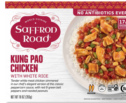
Saffron Road Kung Pao Chicken