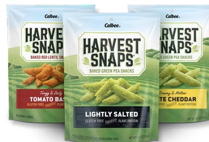
Harvest Snaps Baked Peas